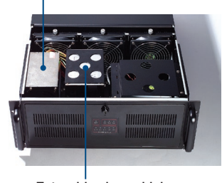
Extra drive bay which can hold up to three 3.5" HDDs