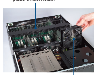
Three 114 CFM hot-swappable fans