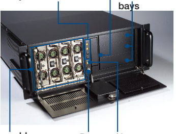
Hot-swappable Power Alarm rese redundant power supply button button