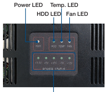
Power voltage status