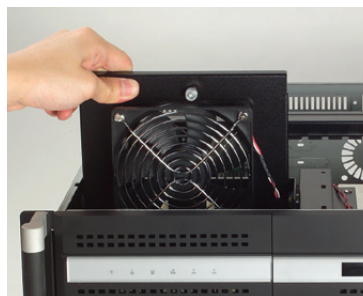
Easy-to-maintain system fan