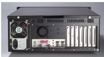
Rear view of ACP-4360MB